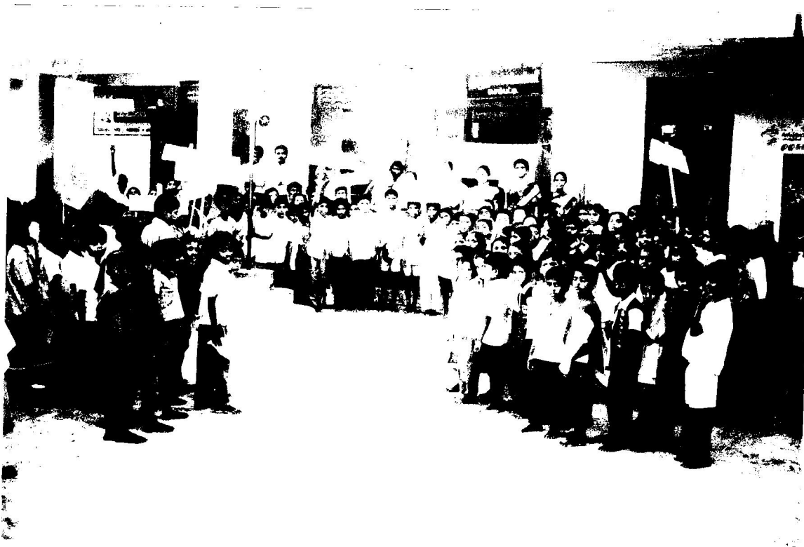
SCNIC Programme (100% Enrolment Campaign)

This programme was sponsored by Action AID India through CEDAR (Nodal Agency), Madurai. But the cash transaction was made by cedar, so, it is not reflected in our Audit Statement, SEEDS worked as organizer and facilitator for this Programme.