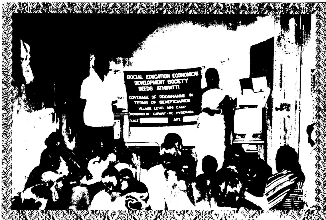
Organization of Beneficiary Scheme to Quarry Workers.

Under this scheme we have organized 205 Women Labour Working in Granite quarries in 8 Villages. They are given training on their rights, formation of trade union, Government schemes etc., They were given education their rights in the following aspects permanent employment, PF, gratuity, minimum wages, working hours, medical facilities, maternal benefits, O.T, benefits etc, by legal experts. This programme was supported by CAPART, Hyderabad.