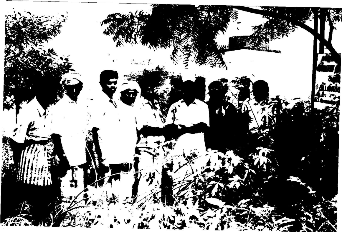
Comprehensive Wasteland Development Programme. (Seedlings Distribution)

Under this programme we did the community organization works in Puliyooran and Kattankudi, panchayat's Comprising 300Ha. Village Development Association (VAP), Area group formation, user group formation and SHG formation have been completed. Trainings have been conducted to VDA members. Entry Point Activity (approach road for SC Colony in Puliyooran) has been completed; Tree plantation work is in progress in the targeted 300Ha. of Waste Land. This programme was supported by ADO, Aruppukottai.