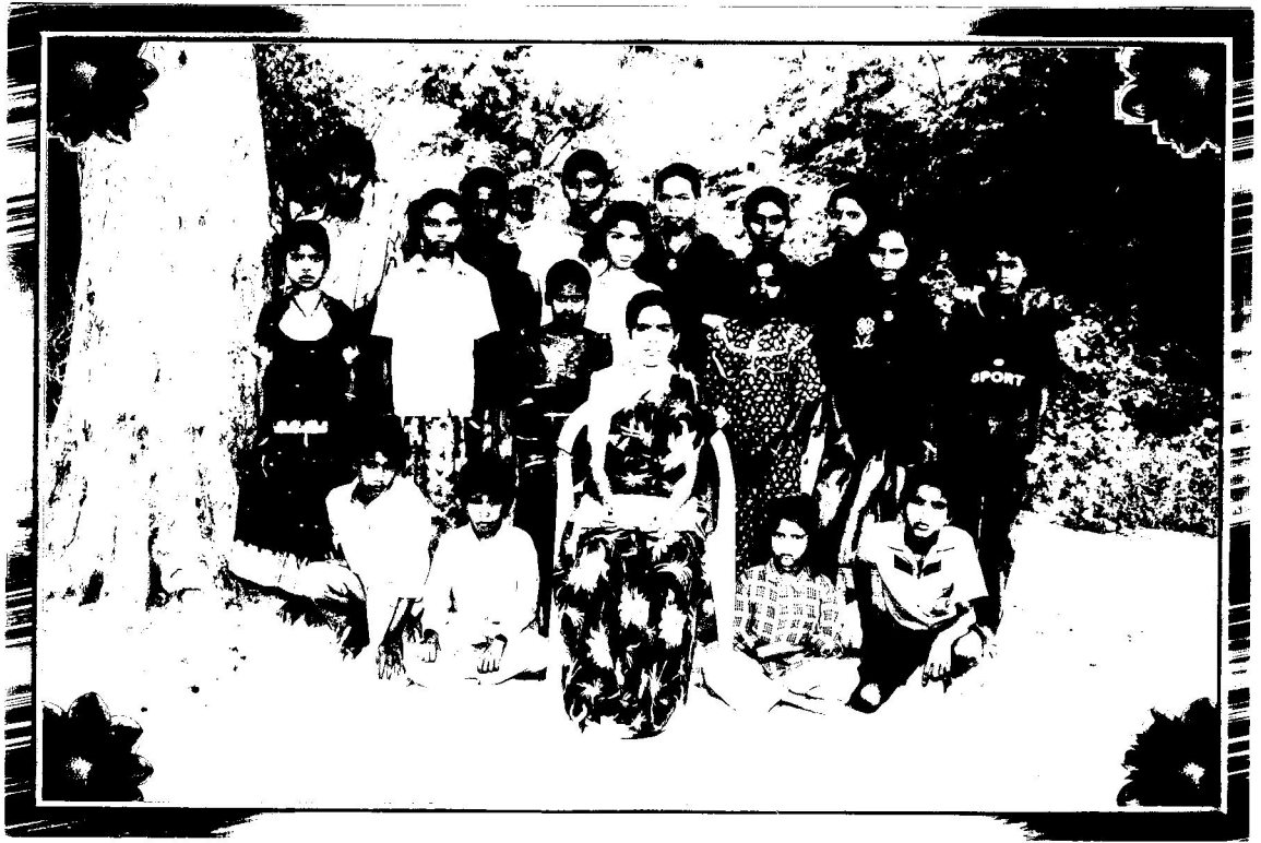
Sarva Shiksha Abhiyan – (SSA) (Children of AIE centre, K. Vahaikulam)

Eradication of child labour, is only possible when all children are give, compulsory, quality, equal and valuable education. To ensure this point we have conducted alternative innovative education (AIE) centre under SSA Programme of Government of Tamilnadu. The AIE schools are conducted in Maninagaram, Kovilangulam, Market areas, Chinna Cherikurichi, Kurunthamadam, K.Vahaikulam Villages. Total 83 students have been enrolled in this AIE centres and they had been provided free educational Kit, uniform, medical aid, educational exposure. This student will be mainstream with regular schools after successful completion.