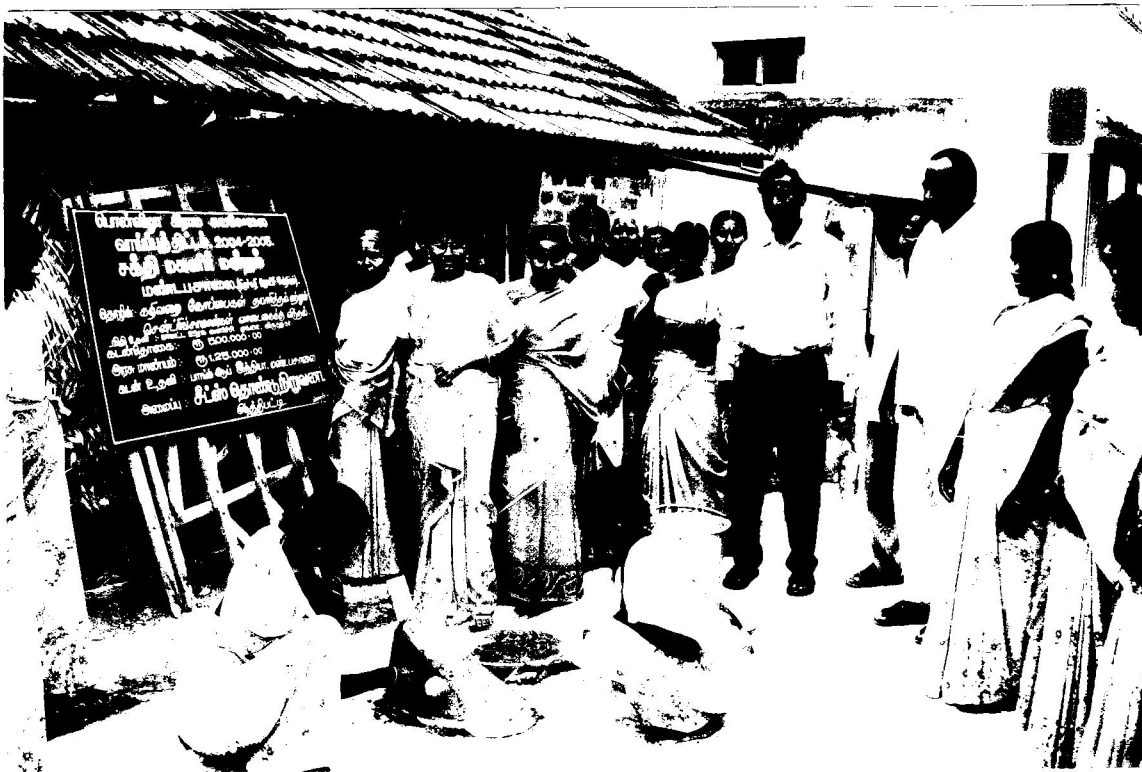
Income Generation Training (Sanitary Pan Production)

The main objective or goal of SEEDS is Women Empowerment. We work hard for empowering women by means of establishing their rights through trainings, meetings, campaigns and other possible ways.