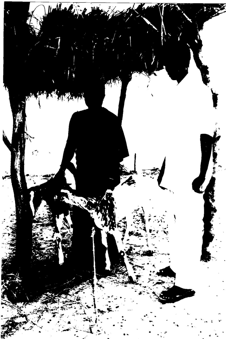
Income Generation (GOAT REARING) By SHG member.

As part of promoting Entrepreneurship and micro enterprise 6 women groups have been provided with financial assistance to the sum of 12 lakhs to enable them to start their own enterprise and providing them EDP (Entrepreneurship Development Training) training with the contents, survey for potential enterprise, demand us supply, processing production, effective marketing including market survey and market analysis, pricing of the product and book keeping. 3 SHGs in Thiruchuli Block and 5 SHGs of Aruppukottai Blocks have been able to successfully promote the following enterprises.