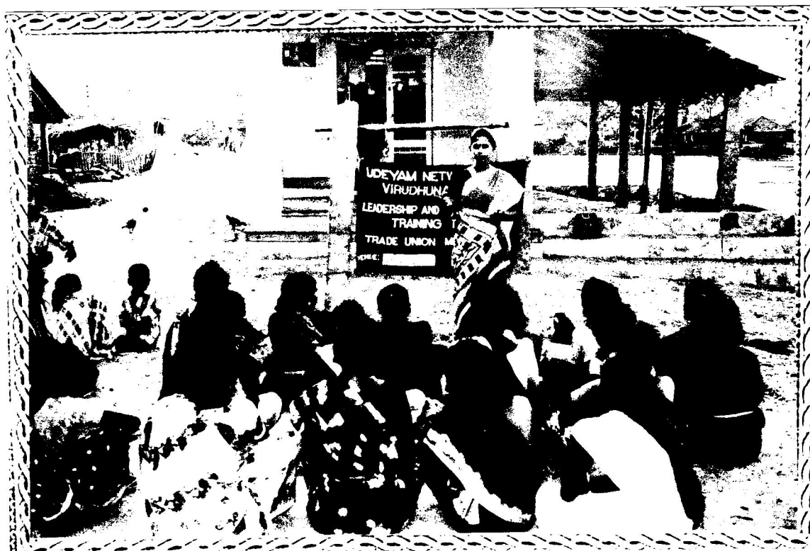
Training to Unorganized Women Labours