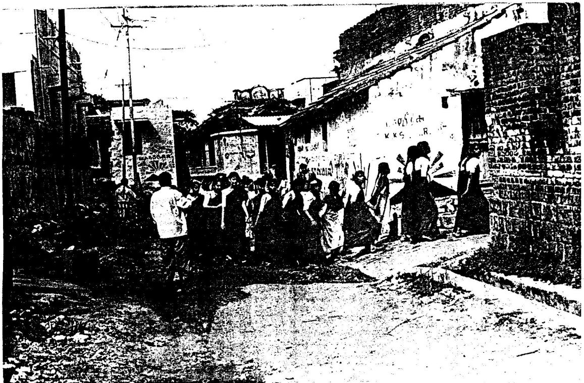
"School Children Rally in Multimedia Campaign"