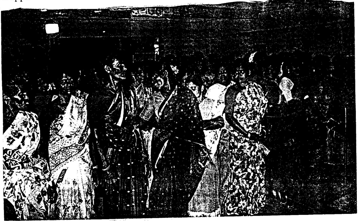
"Cultural Programme for AIDS Awareness"— PARTICIPANTS