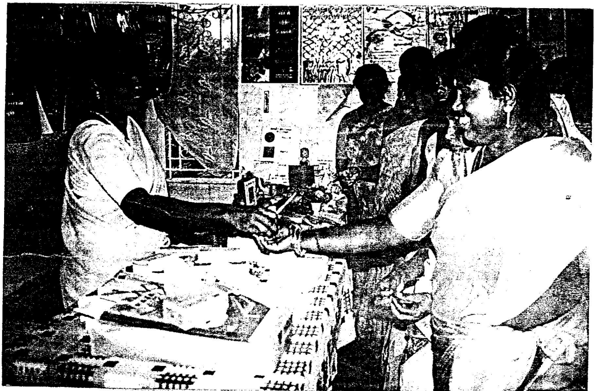
"Health Camp at Puliyooran Villages"

We have organising one free eye camps one at Sempatti. The teams of St, Luca eye Hospital virudhunagar and district Blindness department were participated. Totally about 236 patients were checked up in these programme among this 19 patients were selected for free catract surgery.