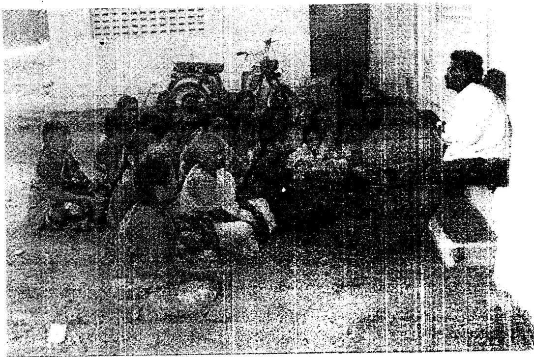
SHG Meeting at Puliyooran Village

Out of these 45 groups, 12 groups are having fully SC women members who were downtrodden for a long period. This poor people had no way to survive better. After becoming our SHG members they are stepping into a new and prosperous future.