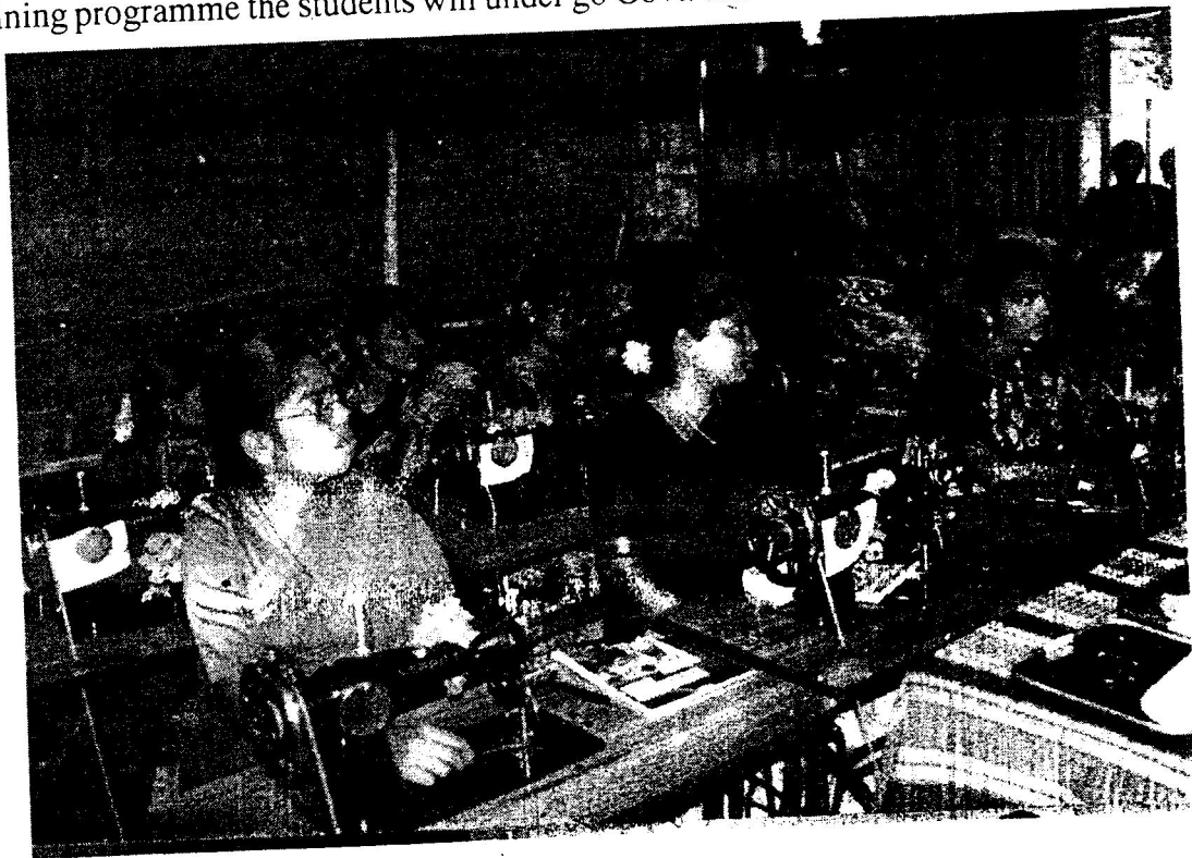
Students in VTP (Tailoring) Class

In this year we have got sanction of VTP for Tailoring, from central social welfare board New Delhi. We have opened a VTP(Tailoring) centre at Aruppukottai. In this centre 25 rural girls were enrolled out of this 25 beneficiaries, 8 are belonged to SC communities. Each student being paid Rs.250/- month as stipend. In this centre tailoring emproidering. Dress making subjects are taught, duration of this programme is one year. At the end of this training programme the students will under go Govt. examination.