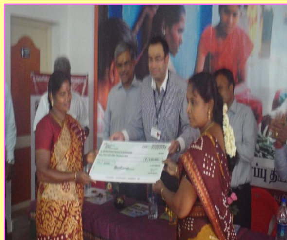
Distribution of Loan to Bharatham SHG by ICICI