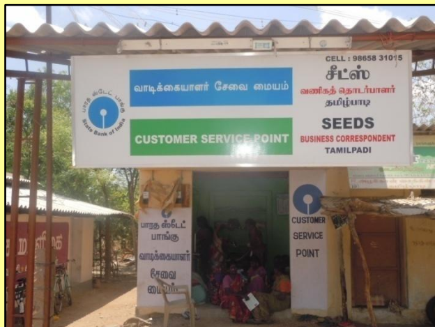
Our CSP center at Tamilpadi