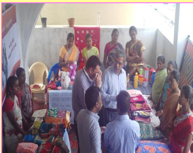
During the Visit to SHG members activities

In the Exhibition, the women members put their products like big shoppers bags, Ornamental jewels, Fruit Juices, Aari and embroidery works in sarees and other dress materials etc. which spoke on the skill and knowledge of the SHG members.