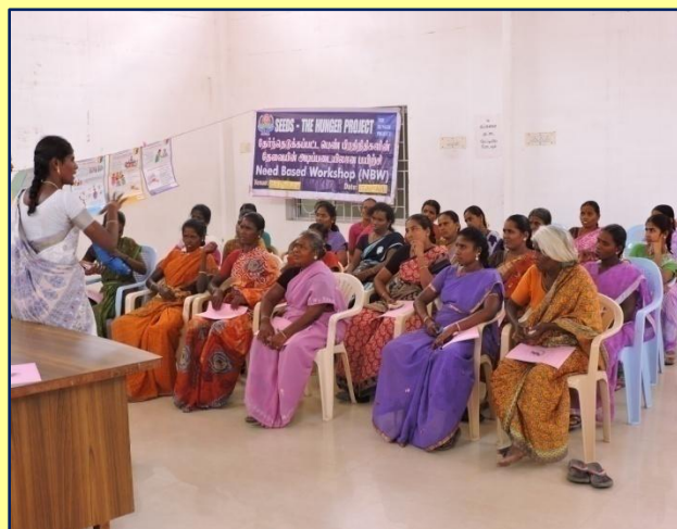
During the need based workshop