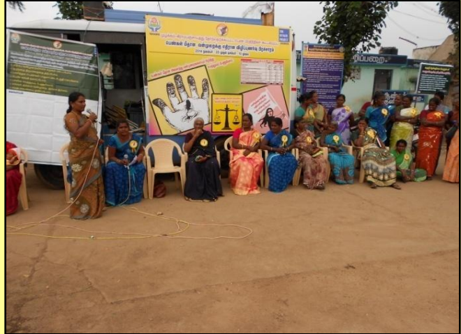
VAW Mobile Van Campaign Programme