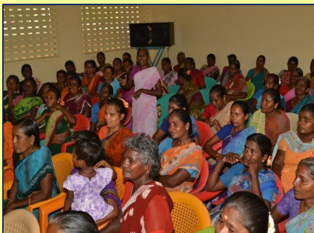
During the one day awareness campaign programme for unorganized women labour supported by Ministry Of Labour & Employment, New Delhi