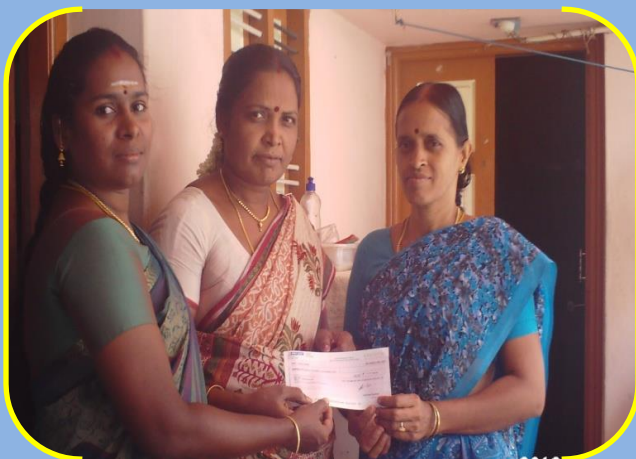
Artisan receiving health benefits

In the reporting year, a baseline survey was completed in Aruppukottai and Kariyapatti Block to find out the potential Women Artisans in Hand Embroidery. Through the survey Seeds selected 305 women artisans and ID cards and health cards issued to them. Further we plan to provide skill development training and Design Development workshop to the selected participants to enhance their skill in the latest embroidery design. Under the RGSSBY scheme, 9 artisans got insurance benefit for the amount of Rs. 22379/-