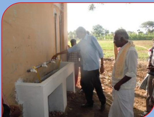
Inauguration of Water Tank in Chitalankundu School