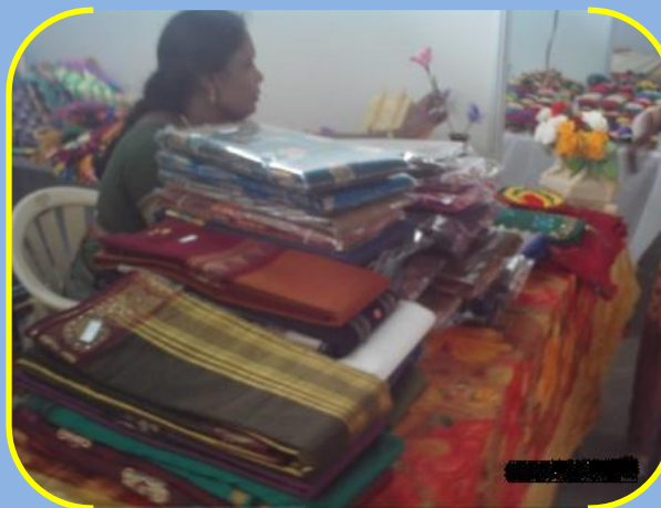
Participation in Craft Bazar at Madurai Thamukkam