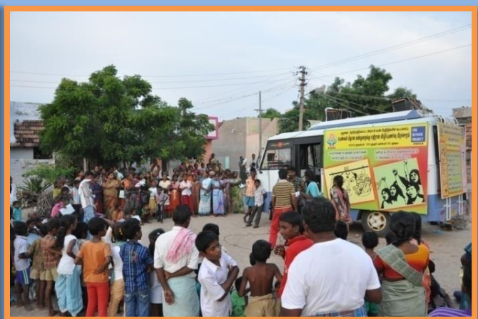
Violence Against Women – Vehicle Campaign