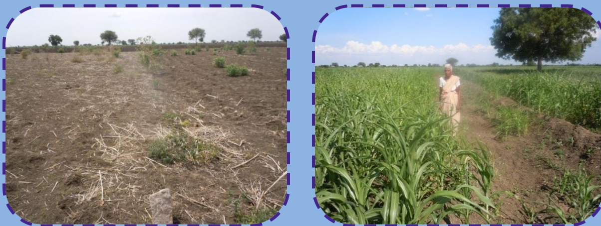
Before and after formation of Filed bunds

WDF. She had contributed 16% of total cost for this field bund by means of Shramdhan. Due to the field bund the rain water did not flow out from her land and stagnated in her land. The moisture and water content is more in this soil. This year she sows red sorghum and the crop grows well and has a green coverage. She hopes that the yield will be very profitable and she is confident that she can cultivate every year and earn more. She expressed her sincere and heartfelt thanks to NABARD WDF, TAWDEVA, SEEDS, and VWC.