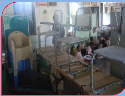
Provision of Furniture to Sempatti School