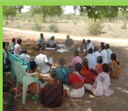
vwc meeting at Alagianallur village