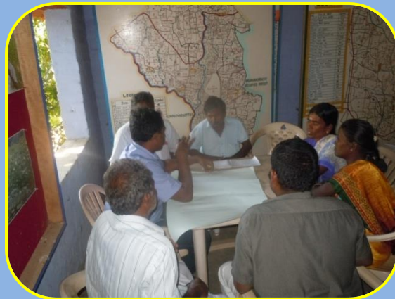
During farmers capacity building and exposure to Ottapadaram village