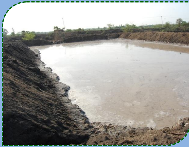
Before and After formation of Farm pond