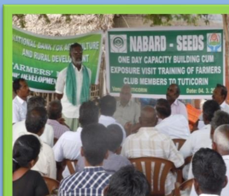
Farmers Exposure & sharing with progressive farmers

Now SEEDS proposes the UPNRLM (Umbrella Program in Natural Resource Livelihood Management) under the support of NABARD. We made a base line survey on the land holders and landless around the watershed villages and selected 125 persons among the vulnerable section and plan to cover them under the UPNRLM project. The main intention is to improve the livelihood and economic status of the peoples around the watershed area.