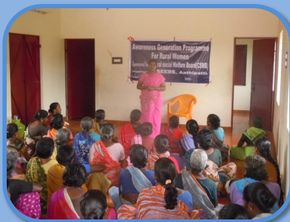
Awareness Generation Programme