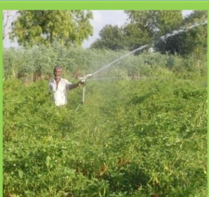
Usage of sprinkler by our farmers